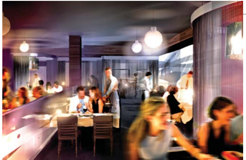
▲ Pearl, Conceptual Sketch

Across town, restaurateur Chad Mackay is putting his signature touches on the iconic high-end steakhouse El Gaucho. Downtown Bellevue is the fourth El Gaucho location in the Northwest and will feature 26-foot ceilings, high windows and a mezzanine, a contrast to the "exclusive hide-away" ambiance of the Belltown location.